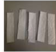
or Paper Towels